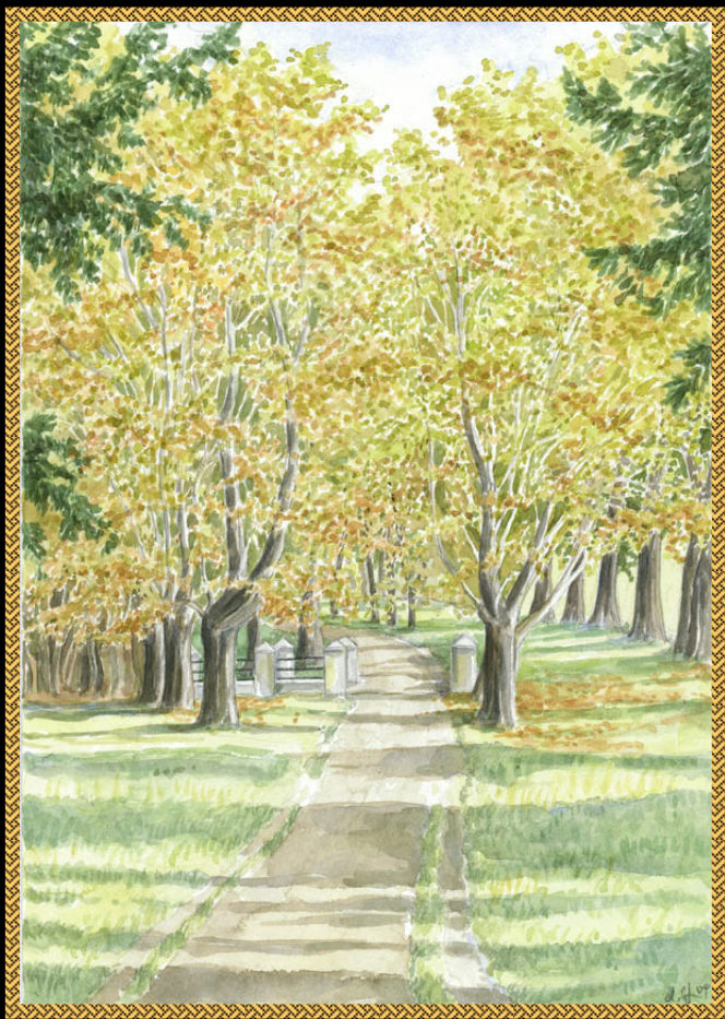
Image of an original watercolor by Anke Eissmann — 2009 Out of the Imagination and Mind's Eye of the Short Story Aficionado™

aBIT of MYSTERY, ROMANCE AND ADVENTURE™ ©1997-2019 by GTTransGlobal™ — RURAL PACIFIC NW U.S.A.